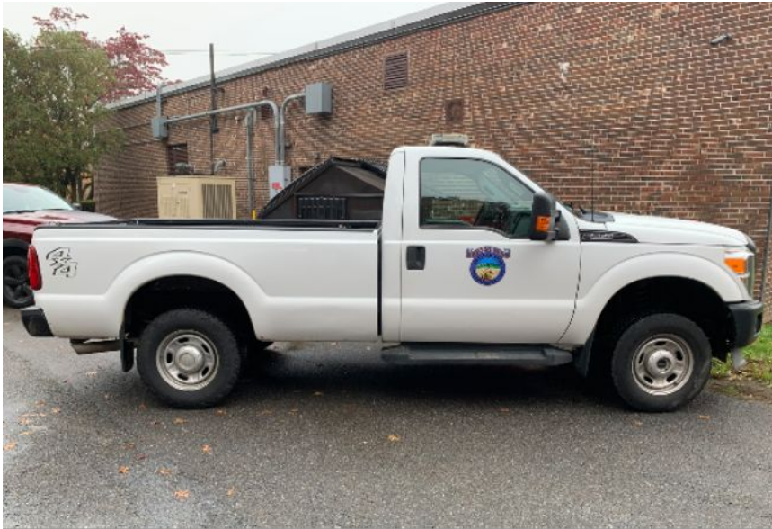
2012 F-250 45,500 MILES

Current Inventory of Department Vehicles: