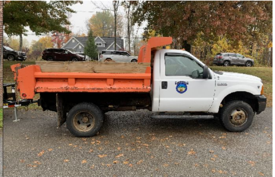
2006 F-350 115,240 MILES

New 2023 F-350 1-ton dump truck with plow (funded in FY23 Capital Plan; no photo/have not taken delivery as of 10/26/22)